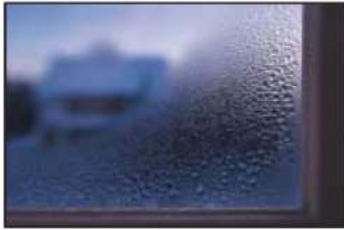
Condensation on the inside of a windowpane.

■ Keep indoor humidity low. If possible, keep indoor humidity below 60 percent (ideally between 30 and 50 percent) relative humidity. Relative humidity can be measured with a moisture or humidity meter, a small, inexpensive ($10-$50) instrument available at many hardware stores.