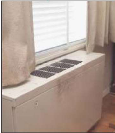
Mold growing on the surface of a unit ventilator.