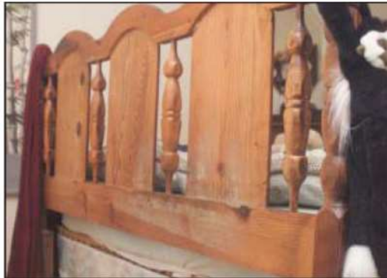
Mold growing on a wooden headboard in a room with high humidity.