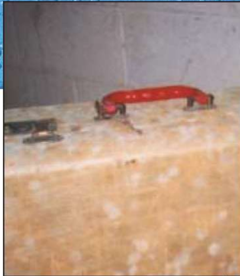
Mold growing on a suitcase stored in a humid basement.

It is important to take precautions to LIMIT YOUR EXPOSURE to mold and mold spores.