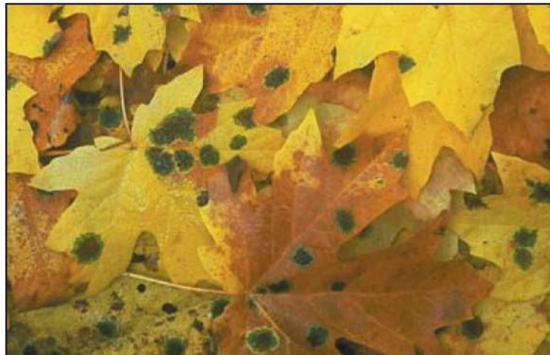
Mold growing on fallen leaves.

This document is available on the Environmental Protection Agency, Indoor Environments Division website at: www.epa.gov/iaq/molds/moldguide.html