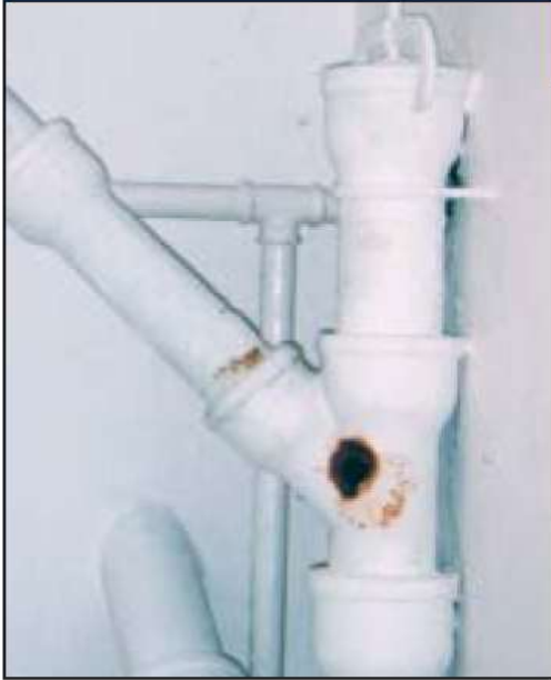
Rust is an indicator that condensation occurs on this drainpipe. The pipe should be insulated to prevent condensation.

Renters: Report all plumbing leaks and moisture problems immediately to your building owner, manager, or superintendent. In cases where persistent water problems are not addressed, you may want to contact local, state, or federal health or housing authorities.