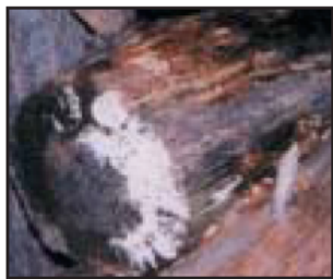
Mold growing outdoors on firewood. Molds come in many colors; both white and black molds are shown here.

W hy is mold growing in my home? Molds are part of the natural environment. Outdoors, molds play a part in nature by breaking down dead organic matter such as fallen leaves and dead trees, but indoors, mold growth should be avoided. Molds reproduce by means of tiny spores; the spores are invisible to the naked eye and float through outdoor and indoor air. Mold may begin growing indoors when mold spores land on surfaces that are wet. There are many types of mold, and none of them will grow without water or moisture.