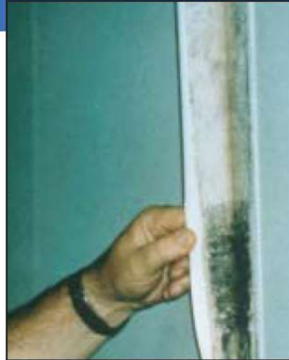
Mold growing on the back side of wallpaper.

Suspicion of hidden mold You may suspect hidden mold if a building smells moldy, but you cannot see the source, or if you know there has been water damage and residents are reporting health problems. Mold may be hidden in places such as the back side of dry wall, wallpaper, or paneling, the top side of ceiling tiles, the underside of carpets and pads, etc. Other possible locations of hidden mold include areas inside walls around pipes (with leaking or condensing pipes), the surface of walls behind furniture (where condensation forms), inside ductwork, and in roof materials above ceiling tiles (due to roof leaks or insufficient insulation).