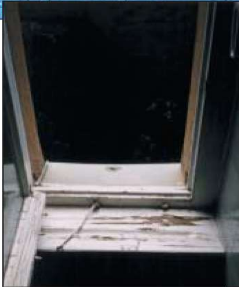
Leaky window – mold is beginning to rot the wooden frame and windowsill.

If you already have a mold problem – ACT QUICKLY. Mold damages what it grows on. The longer it grows, the more damage it can cause.